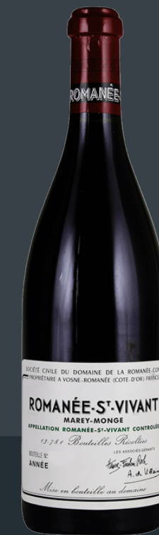
2018 Domaine de la Romanée- Conti Romanée-Saint-Vivant Grand Cru Marey-Monge