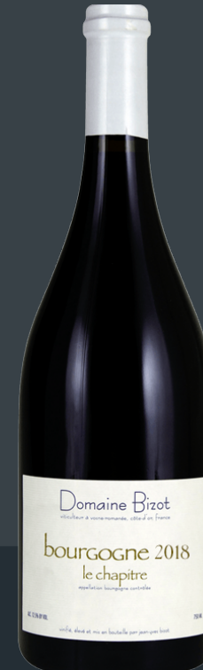
2018 Domaine Jean Yves Bizot Le Chapitre