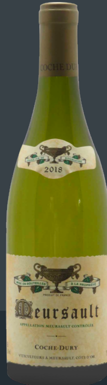
2018 Domaine Coche-Dury Meursault