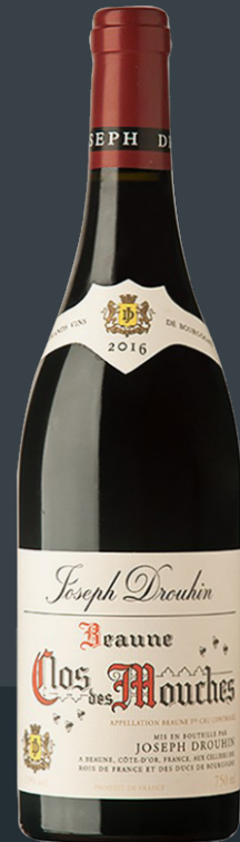
2016 Joseph Drouhin Beaune Premier Cru Le Clos Des Mouches Rouge